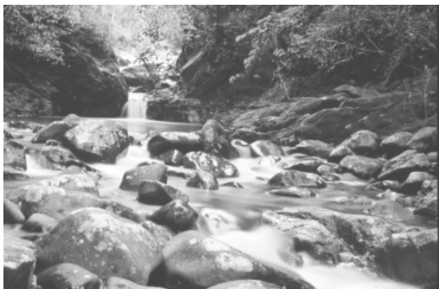
Fig. 6. Habitat of Rana khalam , new species, in Bach Ma National Park, Thua Thien-Hue Province, Vietnam.