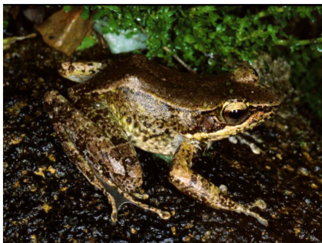
Fig. 3. Female paratype of Rana khalam , new species, in life from Bach Ma National Park, Thua Thien-Hue Province, Vietnam.

Remarks. – Higher level taxonomy within the large family Ranidae remains problematic and uncertain (e.g. Dubois, 1992; Inger, 1996; Dubois, 1999; Chen et al., in press). Cascade frogs have been variously placed in the genera Rana , Amolops , Huia , Meristogenys , Hylarana , and Odorrana (Bain et al., 2003). Dubois (1992) proposed a generic classification for the Ranidae based on phenetic comparisons, but this classification has received spirited criticism (Inger, 1996), and a recent phylogenetic analysis of Asian ranids has found only partial support for Dubois’ classification (Chen et al., in press). We adopt the conservative approach of treating khalam as a member of the genus Rana sensu lato pending a phylogenetic analysis that includes this new species.