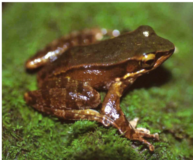
Fig. 2. Male paratype of Rana khalam , new species, in life from Xe Sap National Biodiversity Conservation Area, Xe Kong Province, Laos.

Distribution and ecology. – Rana khalam is known from Xe Sap National Biodiversity Conservation Area in Xe Kong and Saravane Provinces, southern Laos; Bach Ma National Park in Thua Thien-Hue Province, central Vietnam; and Ba Na National Park, Danang Province, central Vietnam (Fig. 5). Specimens were found along small, steep, rocky streams in hilly wet evergreen forest from 1100-1600 m asl (Fig. 6). In July in Laos, all specimens were collected at night perched on rocks, tree roots, and stems and leaves of herbaceous plants less than 7 m from streams. In October in Vietnam, males were calling at night while perched on rocks and branches of bushes above or near streams, and females were on the ground 3-5 m from streams.