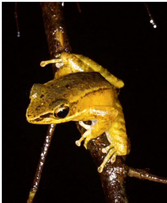
Fig. 4. Male paratype (ZISP 7245) of Rana khalam , new species, in life from Ba Na National Park, Danang Province, Vietnam, exhibiting pale night colouration.

A large number of other Southeast Asian ranids have grooved, expanded finger discs (Yang, 1991; Bain et al., 2003; Orlov et al., 2003), but only R. khalam bears the combination of having an outer metatarsal tubercle, the first finger longer than the second, dorsolateral fold weak or absent, and males with a ventrolateral band of round tubercles with fine, whitish spinules. Rana khalam superficially most closely resembles Huia nasica (Boulenger, 1903), R. archotaphus Inger & Chanard, 1997, R. daorum Bain, Lathrop, Murphy, Orlov, & Ho, 2003, R. trankieni Orlov, Le & Ho, 2003, and R. iriodes Bain & Nguyen, 2004. Rana khalam differs from H. nasica by having gular pouches appearing as skin folds at corners of throat (gular pouches sac-like in nasica ), having a ventrolateral band of round tubercles containing fine whitish spinules in males (male nasica with whitish spinules scattered ventrally near to the groin and in a small, ventrolateral cluster near to the insertion of the forearm), having small white